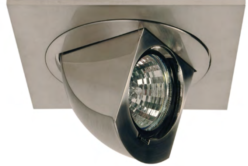
T7124-12BR (illustrated) (Lamp not included)